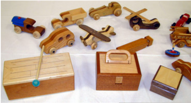
A selection of OCWA toys.