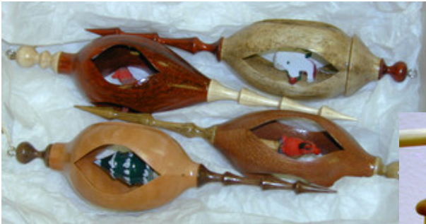
Ornaments: authors unknown