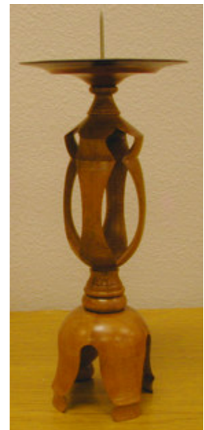
Yes, it was done all on a lathe